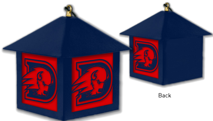
Front Navy on Red $74.99 (MSRP) DSU - L - 0001

Light up your fan cave with one of our popular hanging lamps!